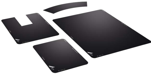
DÜRR NDT Imaging Plates with active side (white/blue) down.

The DÜRR NDT Imaging Plate product range has been carefully designed to fit the specific needs of the non-destructive testing industry with the different types covering the widest range of possible radiographic testing applications.